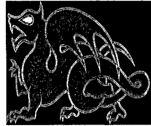
New City Academy Logo